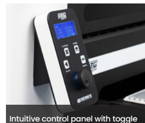
Intuitive control panel with toggle