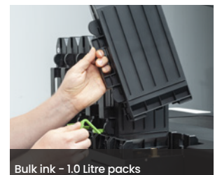
Bulk ink - 1.0 Litre packs