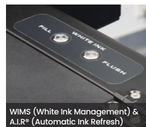
WIMS (White Ink Management) & A.I.R.® (Automatic Ink Refresh)